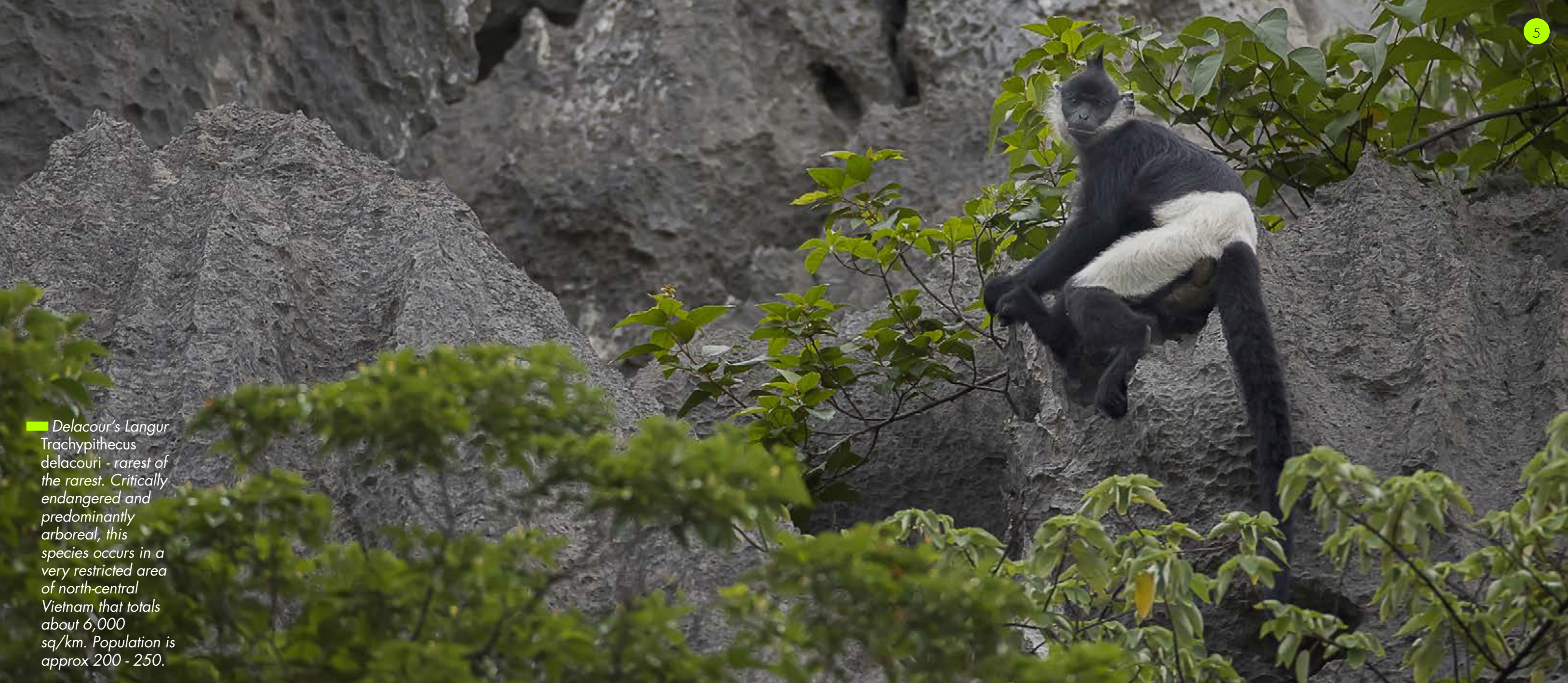
■ Delacour's Langur Trachypithecus delacouri - rarest of the rarest. Critically endangered and predominantly arboreal, this species occurs in a very restricted area of north-central Vietnam that totals about 6,000 sq/km. Population is approx 200 - 250.