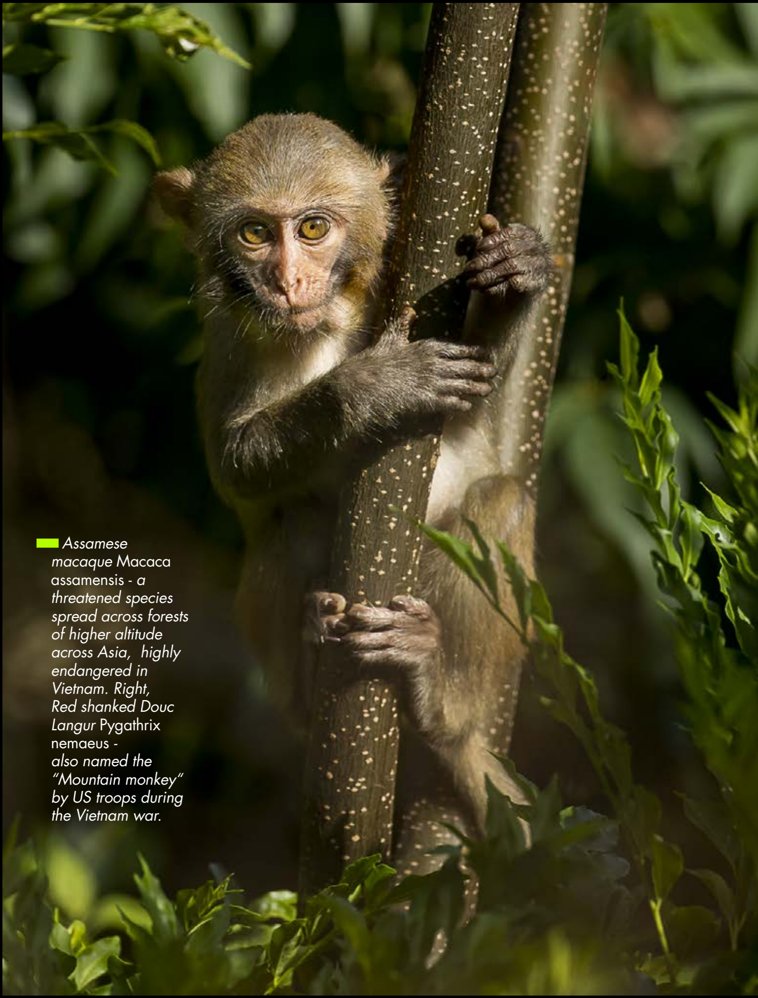
■ Assamese macaque Macaca assamensis - a threatened species spread across forests of higher altitude across Asia, highly endangered in Vietnam. Right, Red shanked Douc Langur Pygathrix nemaeus - also named the "Mountain monkey" by US troops during the Vietnam war.