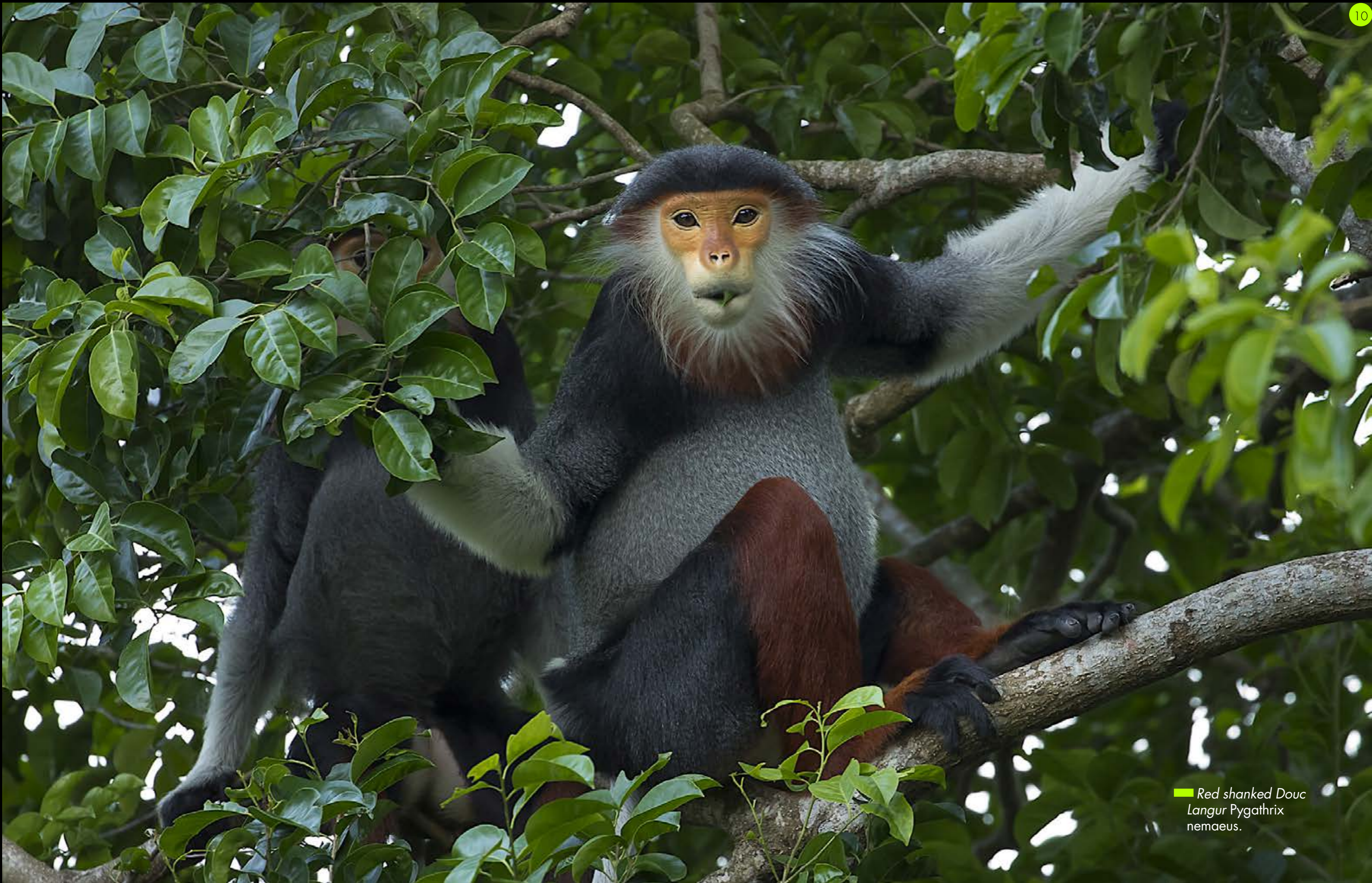
Red shanked Douc Langur Pygathrix nemaeus .