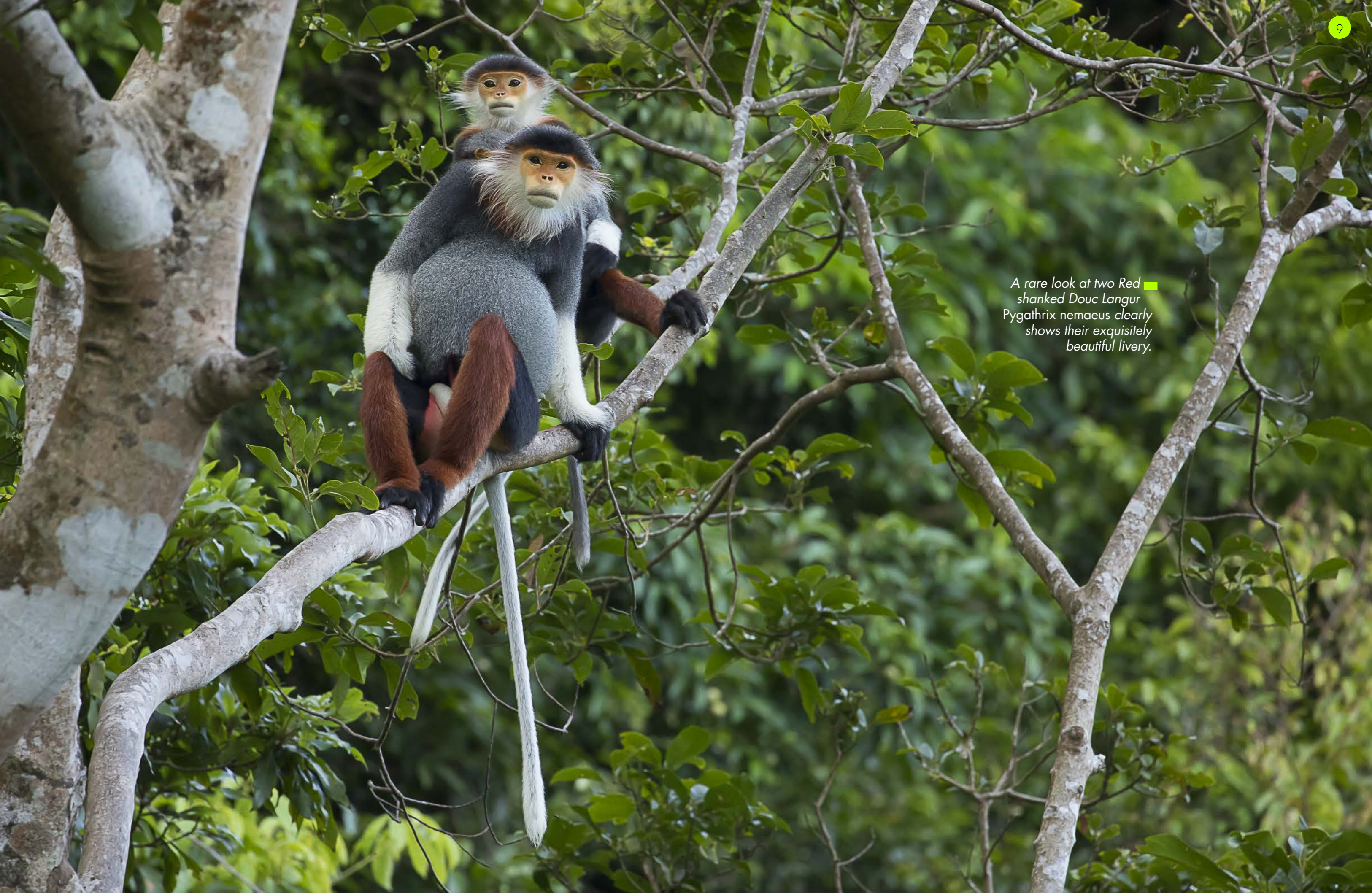
A rare look at two Red-shanked Douc Langur Pygathrix nemaeus clearly shows their exquisitely beautiful livery.