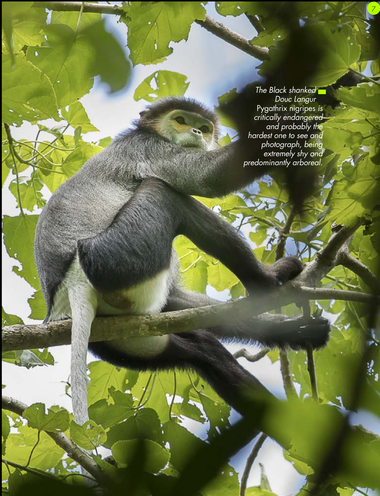
The Black shanked █ Douc Langur Pygathrix nigripes is critically endangered and probably the hardest one to see and photograph, being extremely shy and predominantly arboreal.