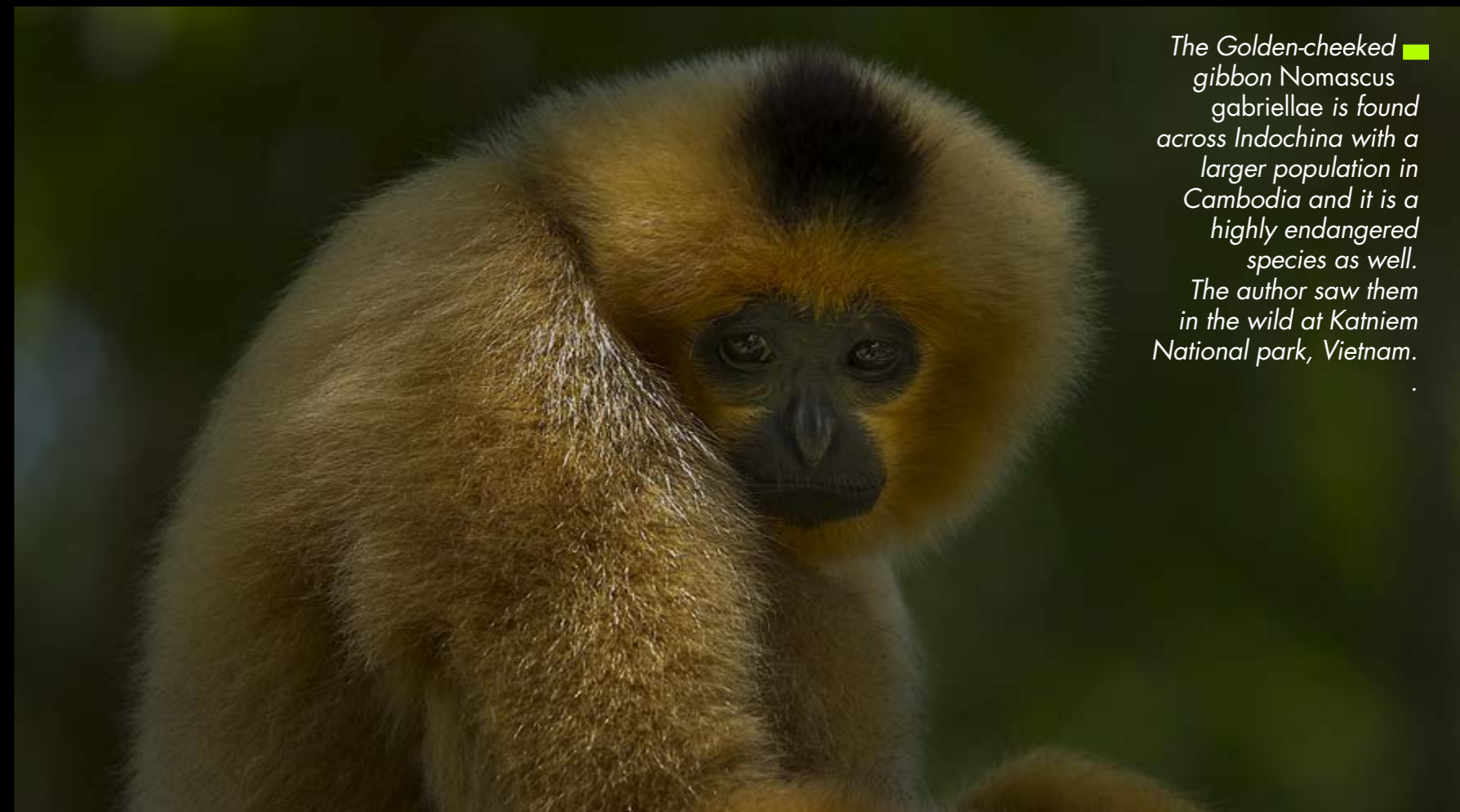
The Golden-cheeked gibbon Nomascus gabriellae is found across Indochina with a larger population in Cambodia and it is a highly endangered species as well. The author saw them in the wild at Katniem National park, Vietnam.