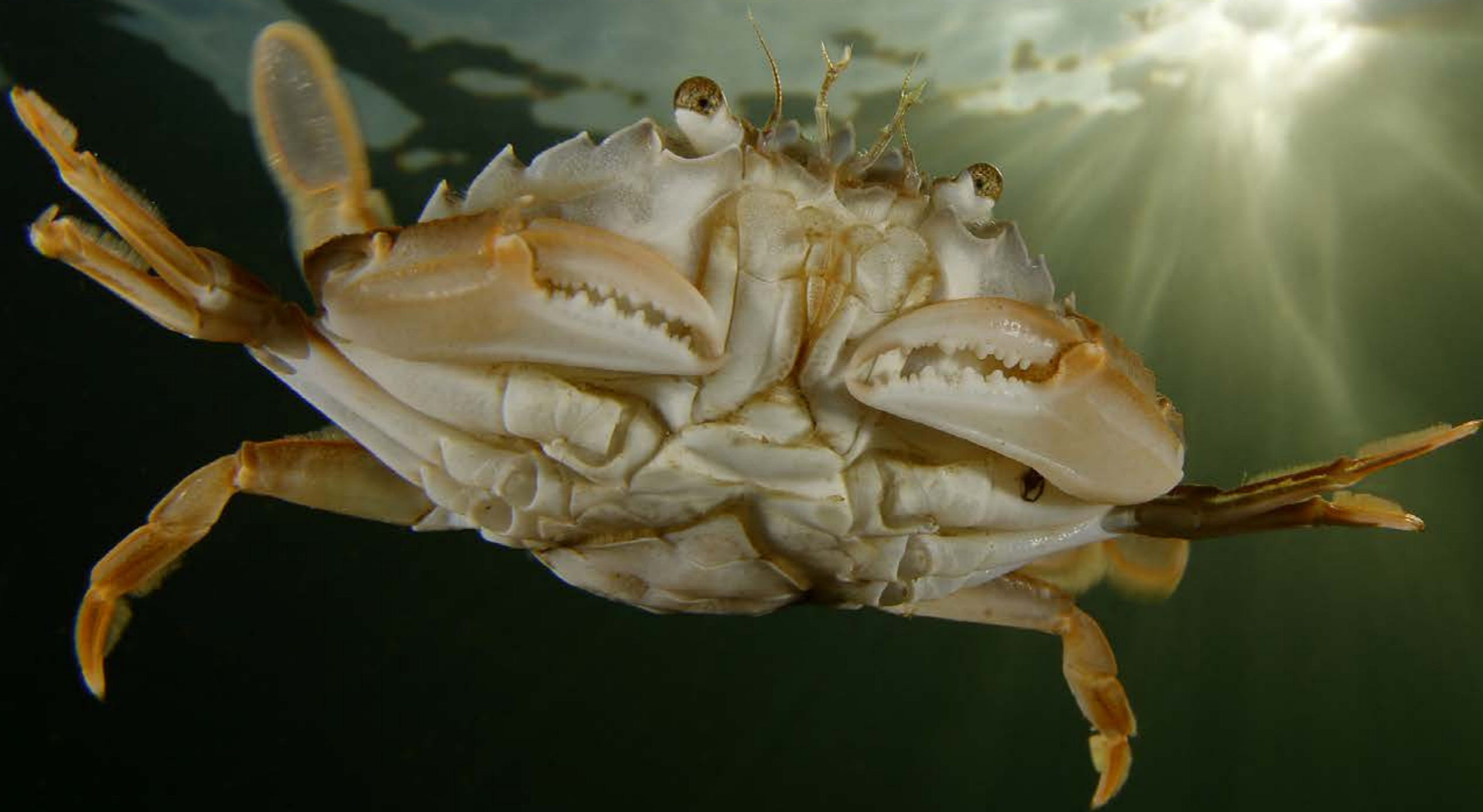
Swimming crab in the sun