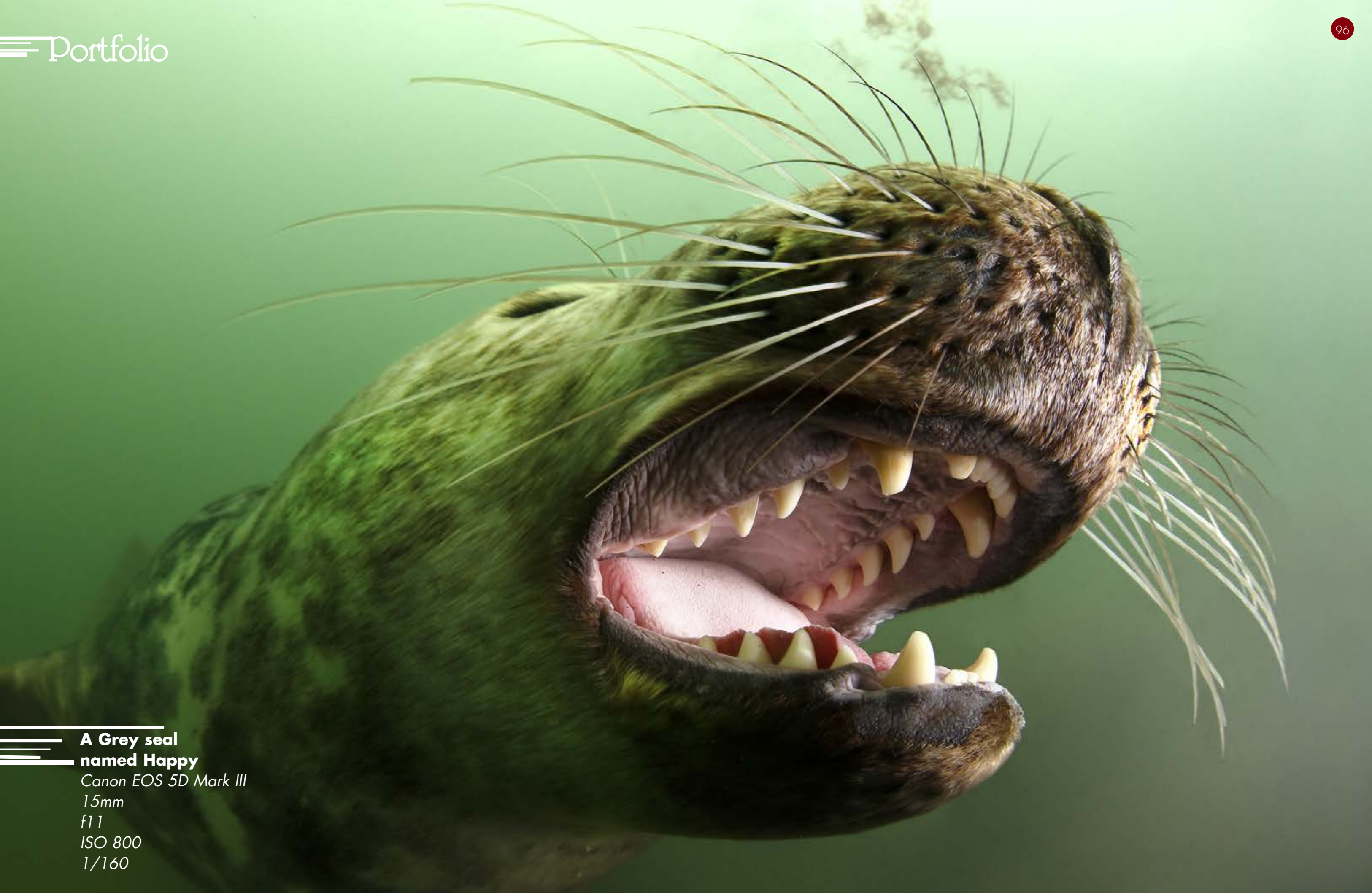
A Grey seal named Happy