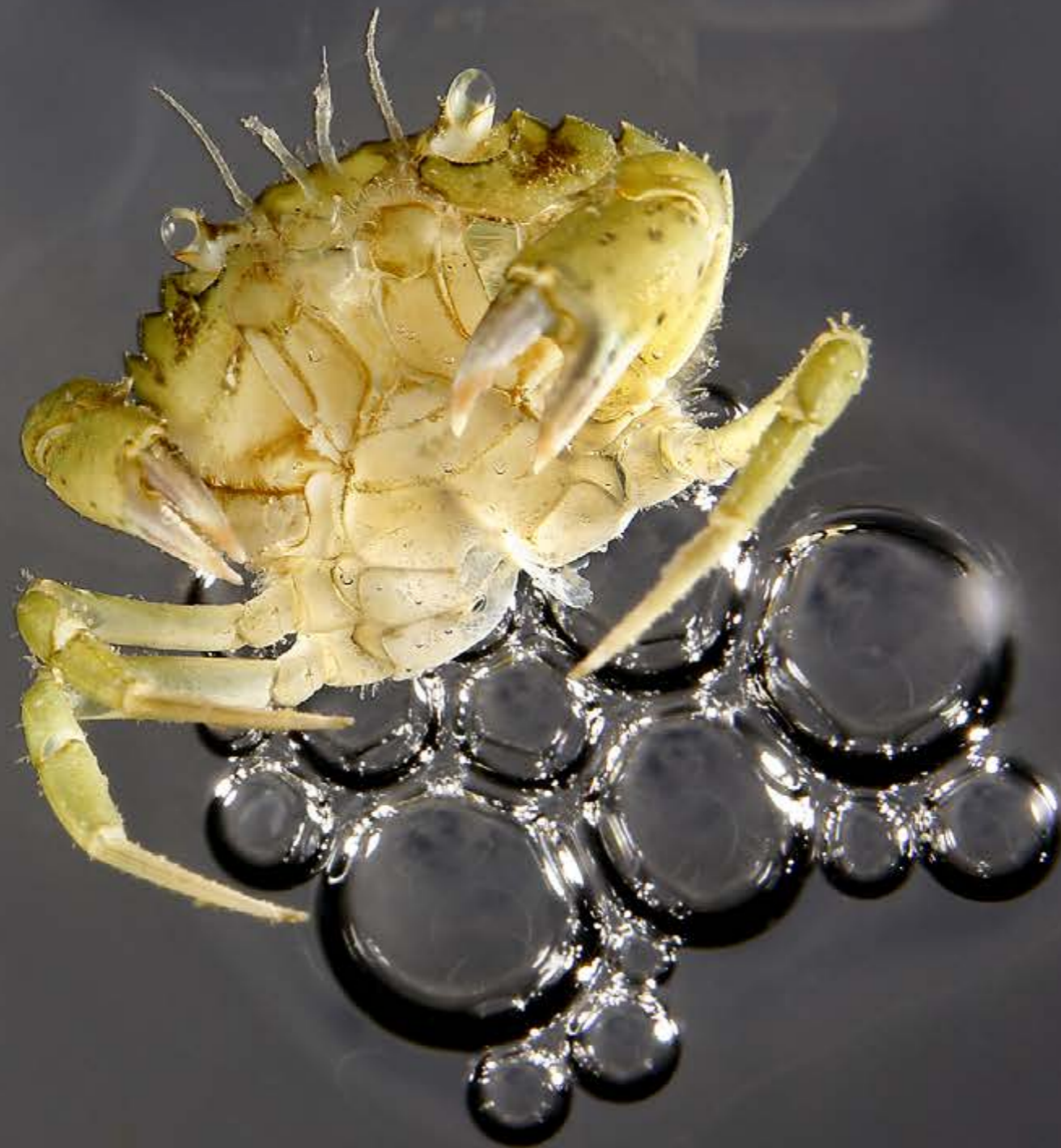
Crab on the surface playing with my bubbles

Canon EOS 5D Mark III EF50mm f/2.5 Compact Macro f/18 ISO 250 1/200