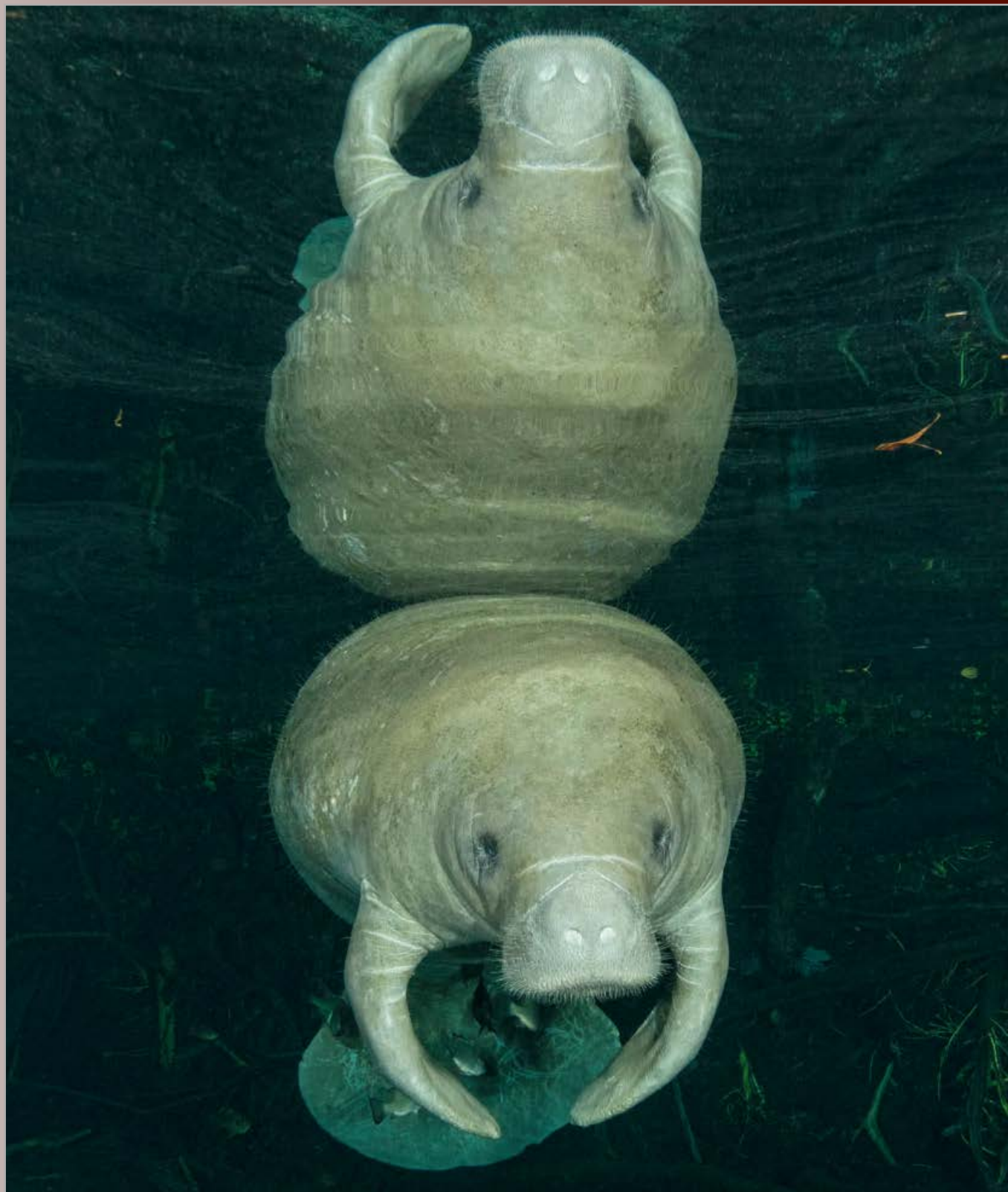
West Indian Manatee Trichechus manatus Manatees (family Trichechidae , genus Trichechus ) are large, fully aquatic, mostly herbivorous marine mammals sometimes known as sea cows.