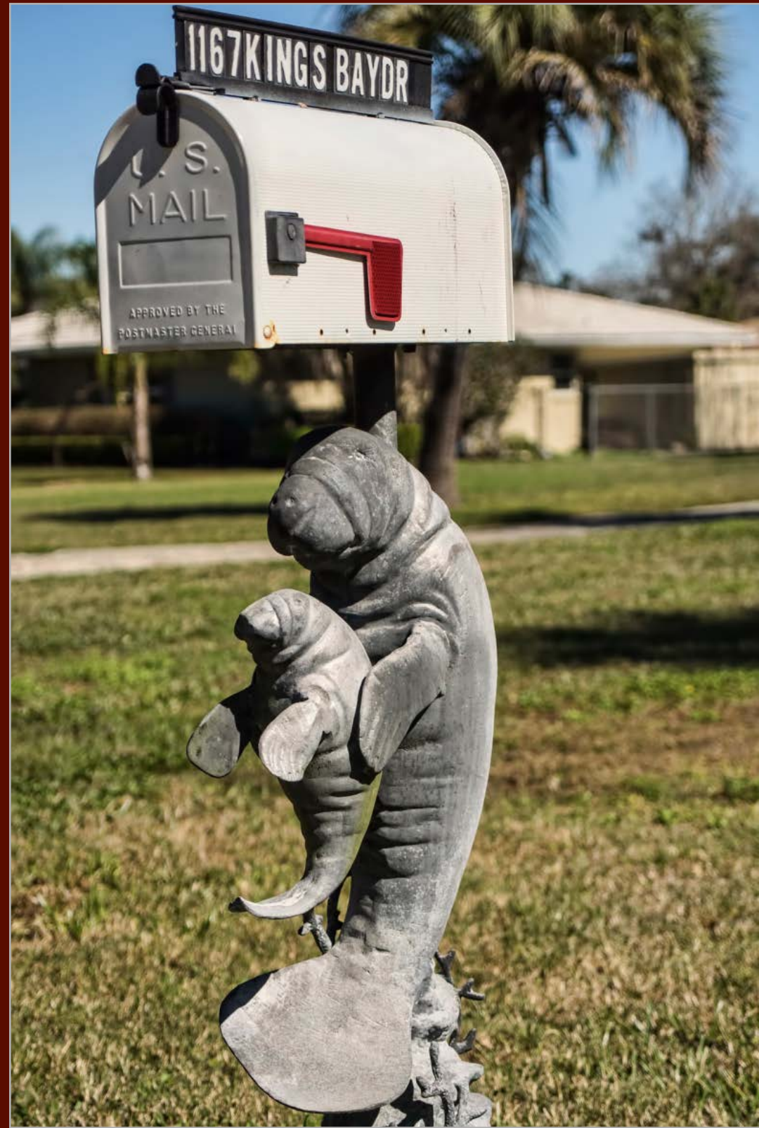
A formidable Florida icon More than 150,000 people have dived with manatees in 2014 - a huge boost to Florida's local economy.