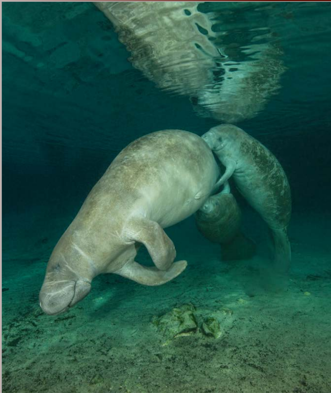
West Indian Manatee Trichechus manatus This trio of Manatees is engaged in a bout of sexual foreplay, leading to later actual mating. Manatees are generally solitary animals.

female manatee can reach 4m in length and about 1500kg - means they have evolved without any natural enemies and have developed a rather slow and passive nature. They get their name from "sirens", the ancient term used to describe the sea nymphs and their captivating songs that lured sailors to their deaths in treacherous shallow waters. Distantly related to elephants, but usually referred to as "sea-cows", there are now only four species of sirenians still alive of the 35 that are known to have once existed - three of which fall in to the Manatee family, while the fourth is in the Dugong family. A sub-species of the West Indian manatee species, the Florida Manatee is usually found in the shallow coastal waters around the state, but in summer can be spotted as far west as Louisiana and all the way up to the Carolinas on the east coast of the USA. Solitary creatures that can live more than 70 years, manatees are the only aquatic mammal that is also an herbivore and they exist on a primary diet of sea grass, the pursuit of which consumes up to 8 hours a day, with a full grown adult consuming up to 10% of its body weight every day. Contrary to what its rotund appearance might suggest, the manatee's diet means that it is actually a really "lean machine" with virtually no fat or blubber to keep it warm when the water temperature drops in winter. At water temperatures below 68 deg F the Florida Manatee simply cannot maintain its core body temperature and will