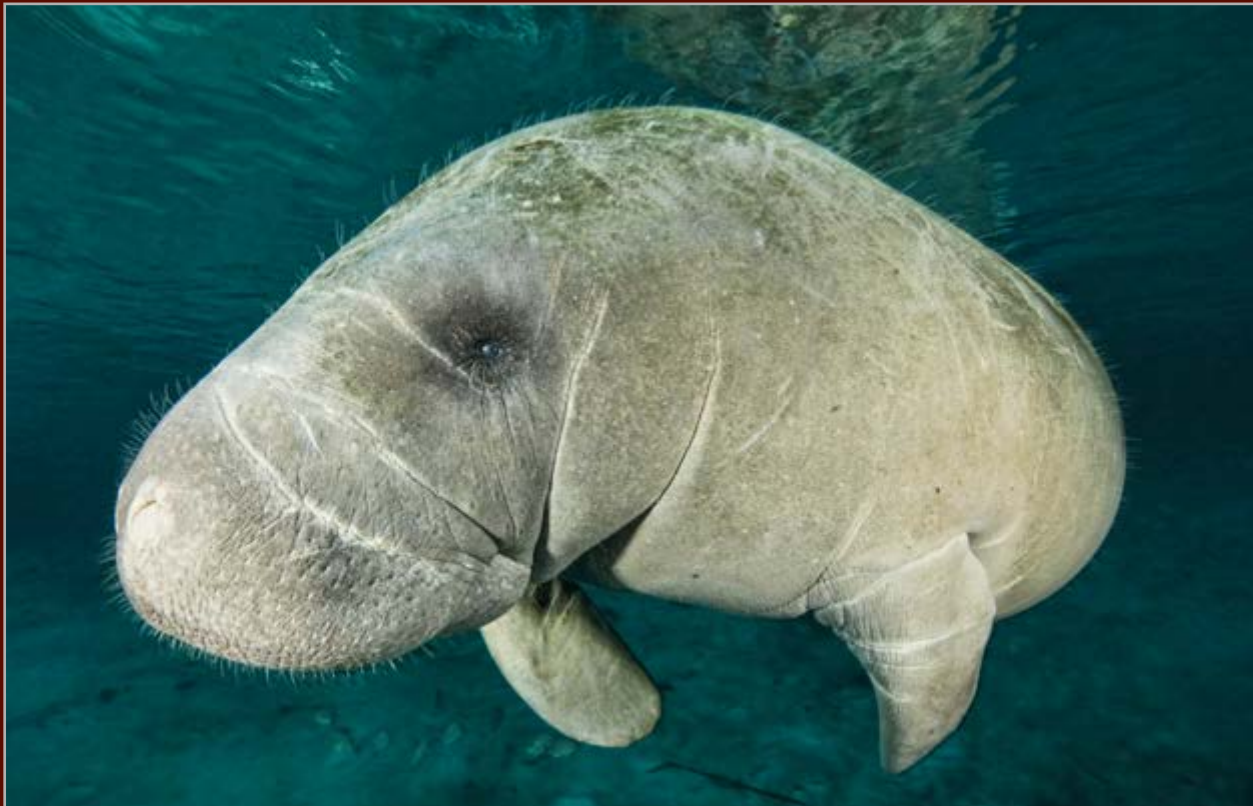
West Indian Manatee Trichechus manatus The name manatí comes from the Taíno, a pre-Columbian people of the Caribbean, meaning "breast".