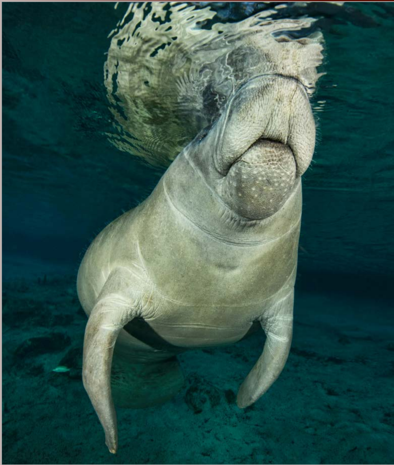
West Indian Manatee Trichechus manatus The Sirenia have evolved from four-legged land mammals over 60 million years ago, with the closest living relatives being elephants and hyraxes.