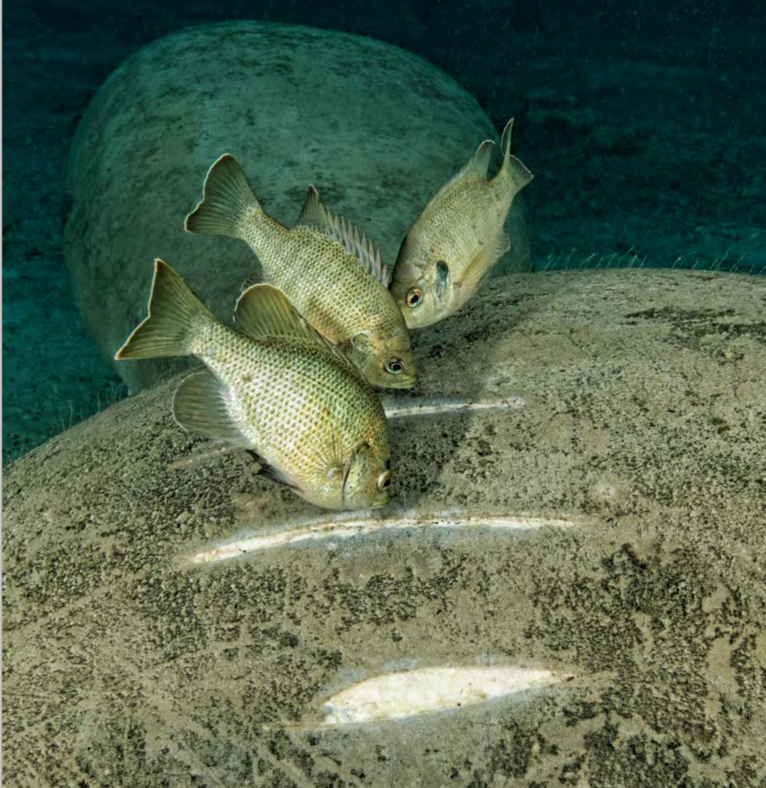
West Indian Manatee Trichechus manatus The deep scars left on a manatee's back by a boat propeller leave little doubt to the dangers facing these slow-swimming marine mammals in Florida waters.