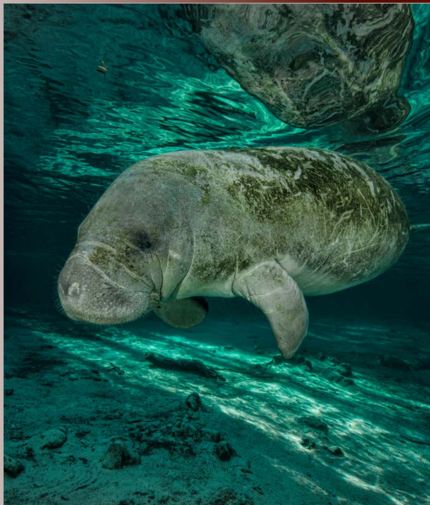
West Indian Manatee Trichechus manatus Manatees measure up to 13 feet (4.0 m) long, weigh as much as 1,300 pounds (590 kg) and have paddle-like flippers.

place under both State and Federal law to protect them. Their basic argument is that manatees have been formally classified as “endangered” under Federal law since 1967, which was probably justified at the time, but the protection mechanisms have worked so it is time to move the status to “threatened” and relax the restrictions which impact heavily on the local boating community. Resident groups such as Save Crystal River point to the increasing number of manatees in Kings Bay as the rationale for the change and even went as far as suing the US Fish and Wildlife Service to make the change – forcing them to formally consider it. Manatee advocacy groups like the Save the Manatee Club have equally strong, but diametrically opposed views, arguing for stronger protection and making the main Three Sisters Spring a closed sanctuary. Their basic argument being that there is still a long way to go before any status change can be considered, pointing to the loss of 830 manatees in 2013 because of unusually cold winter weather and pollution induced red tides.