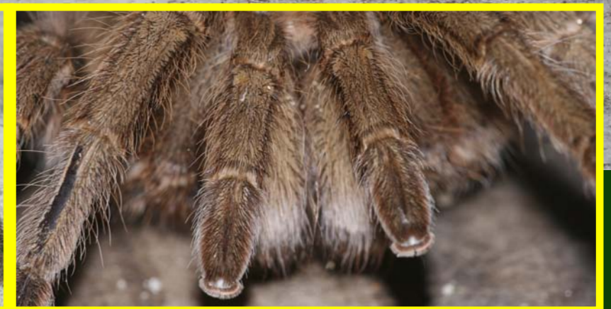
Above, Trichophassus shows the mottled leaf-like camouflage of its wings and the spider mimicry of its frontal legs. Right, two frontal close-ups show how faithfully the 12cm-long moth can imitate the posture of a tarantula's pedipalps and raised front legs.