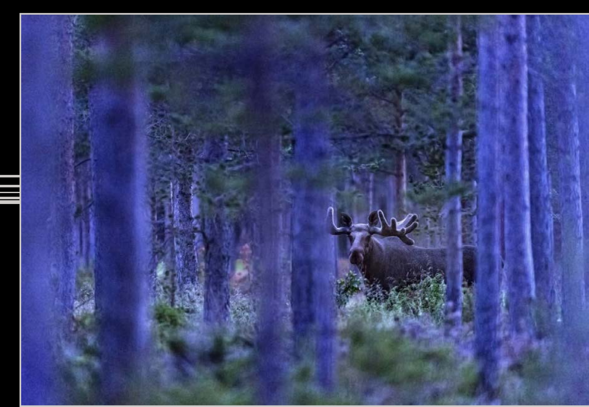
Moose in Sweden, during a summer midnight walk.

Arctic fox in Northeast Greenland at the end of May.