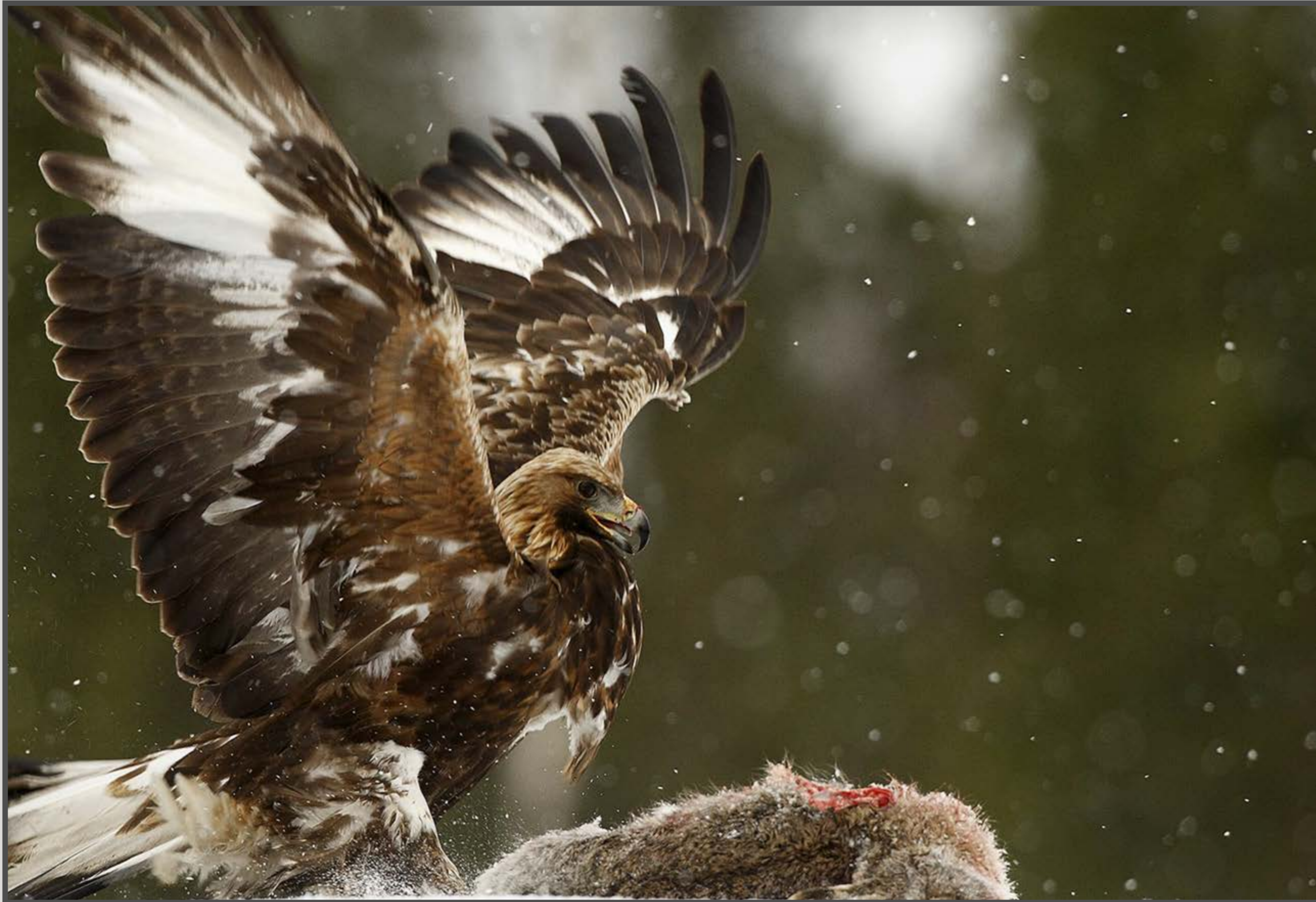
Golden Eagle (Bob Devine - UK) Taken from a hide in Finland.