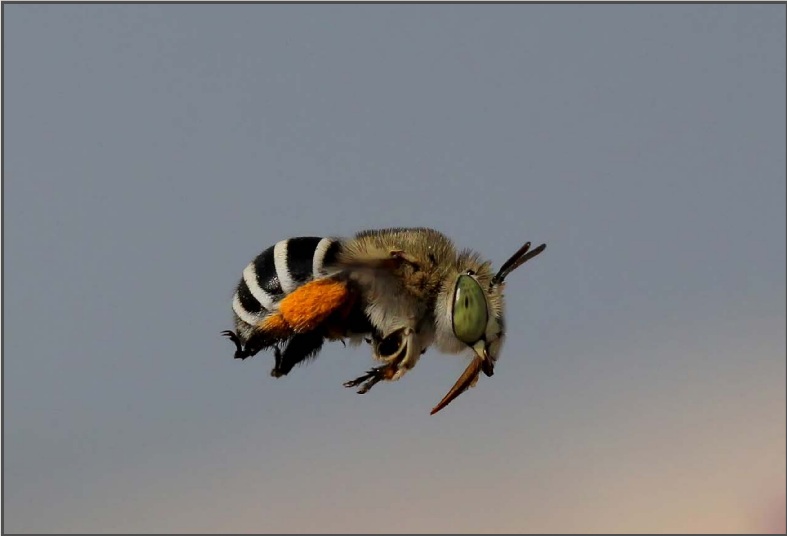
Blue-banded bee in flight Amegilla cingulata

Canon Eos 550D EF 100mm, F:5.6, ISO:400, 1/3200s