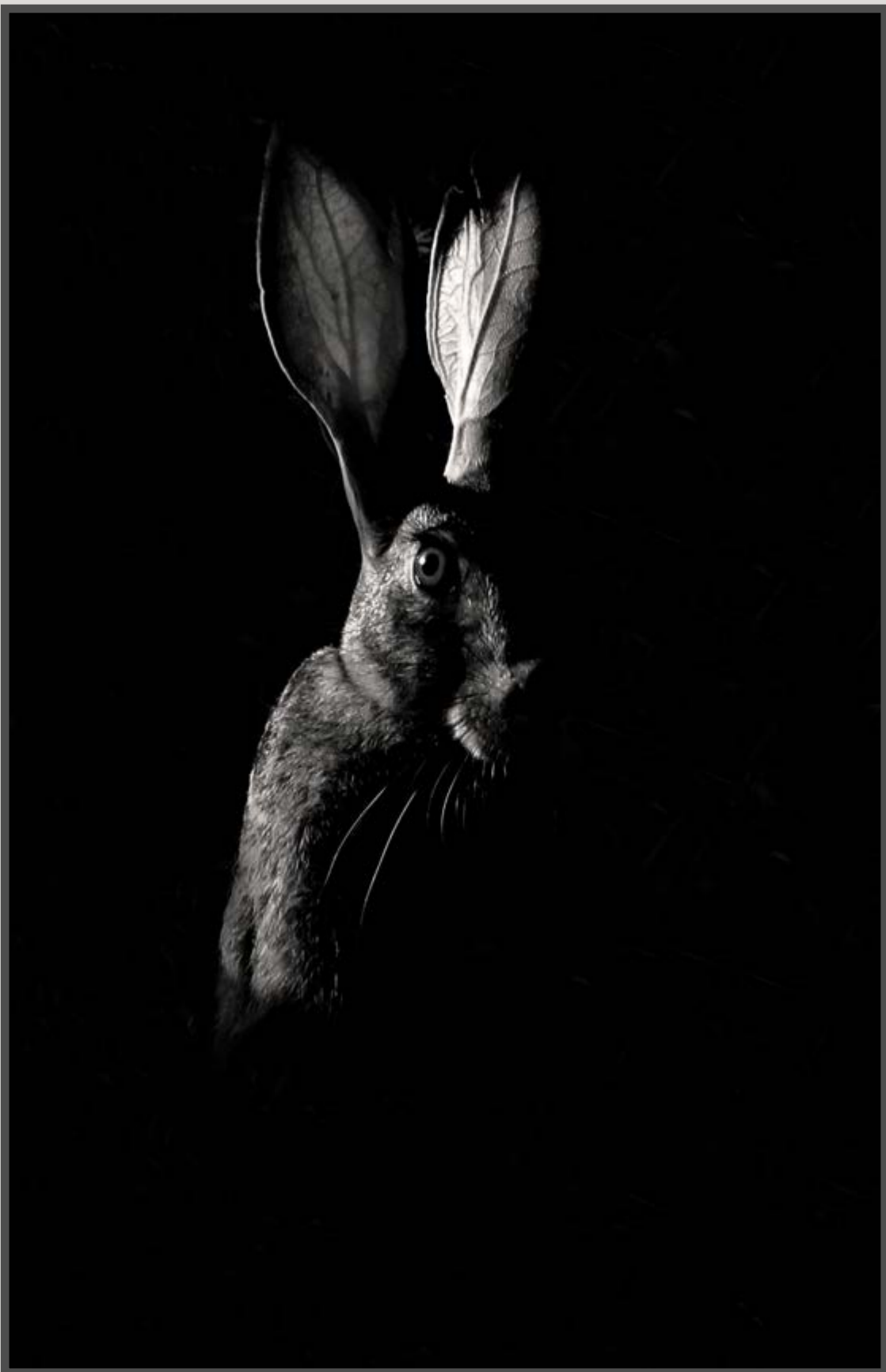
Wild hare Lepus nigricollis

Canon Eos 550D 70-300mm, F:8.0, ISO:800, 1/400s