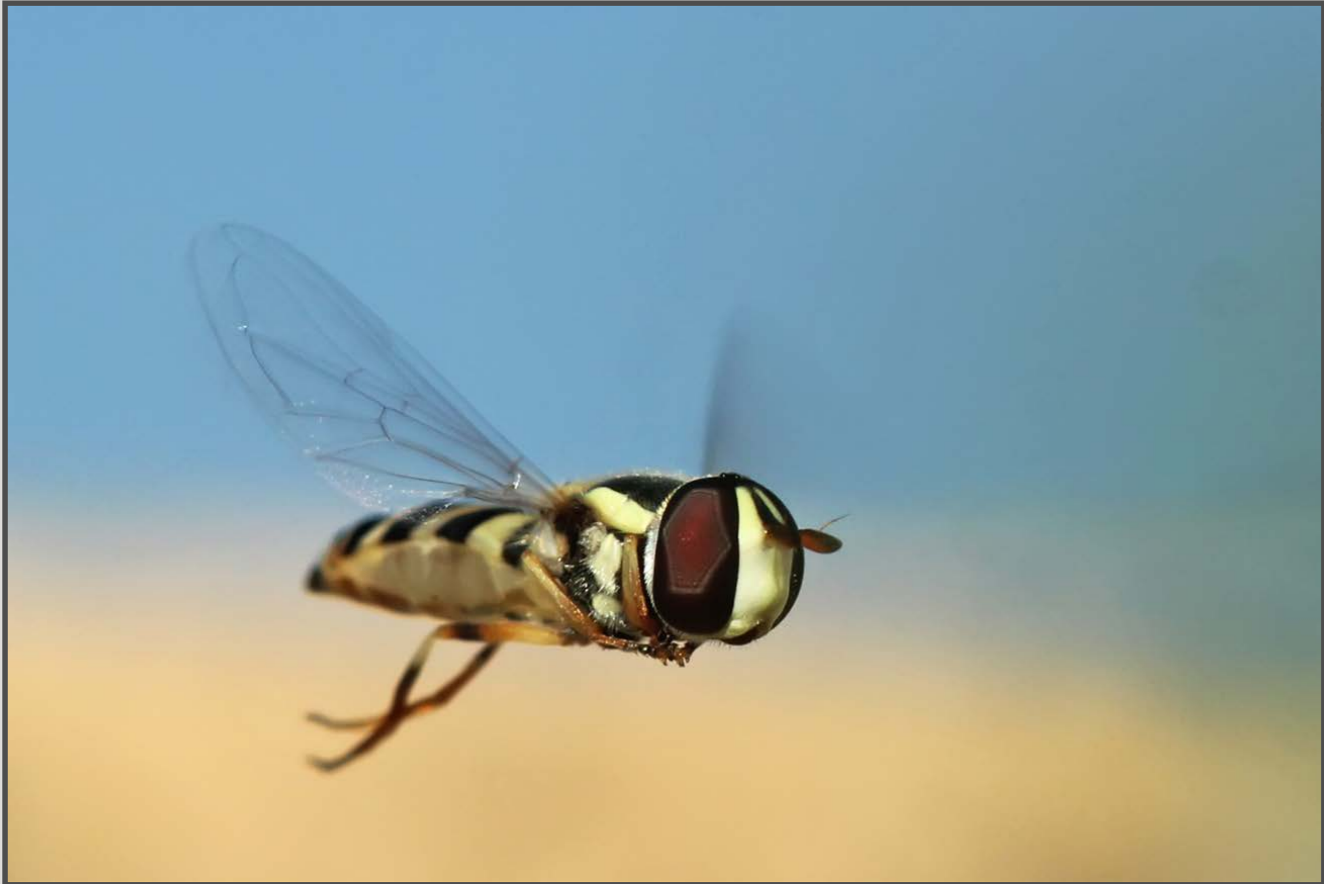
Hoverfly Simosyrphus grandicornis

Canon Eos 550D EF 100mm, F:7.1, ISO:400, 1/1000s