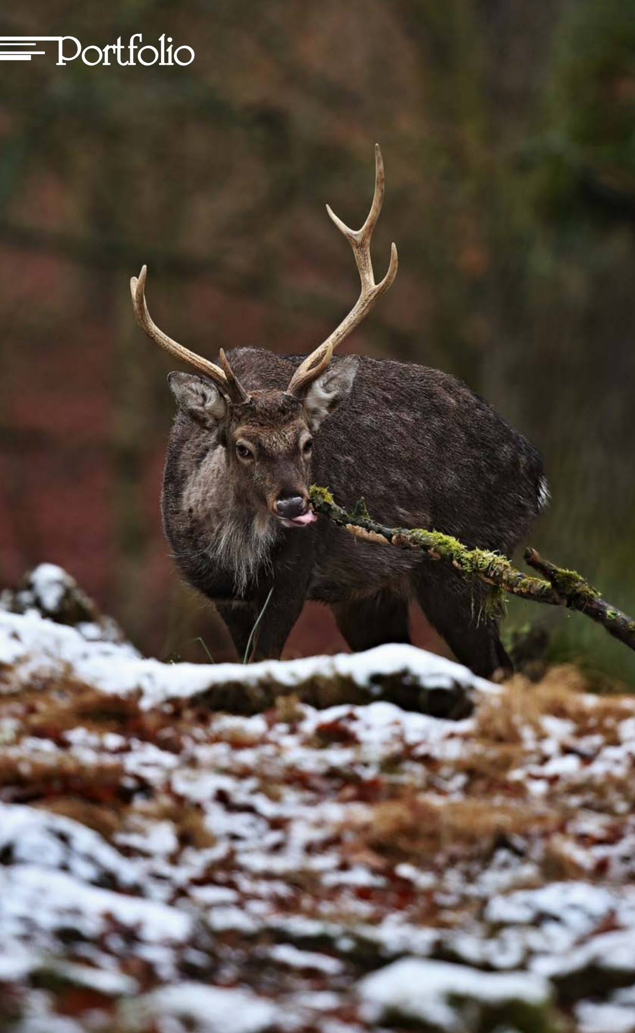
Dybowski deer Cervus nippon dybowskii Czech republic, Canon 5D III, 500mm f4, ISO 800, 1/640, f4