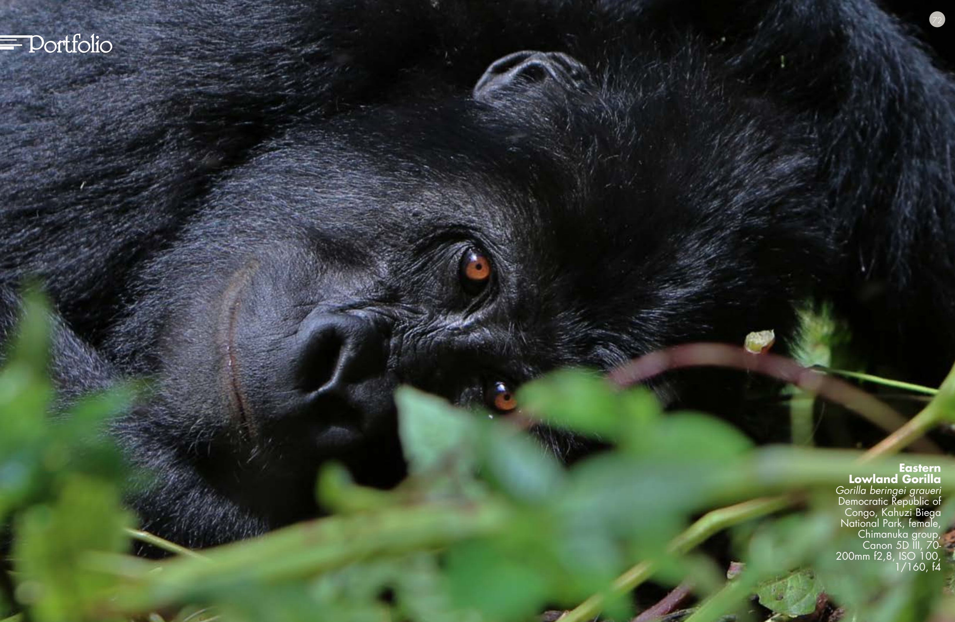
Eastern Lowland Gorilla Gorilla beringei graueri Democratic Republic of Congo, Kahuzi Biega National Park, female, Chimanuka group, Canon 5D III, 70- 200mm f2,8, ISO 100, 1/160, f4