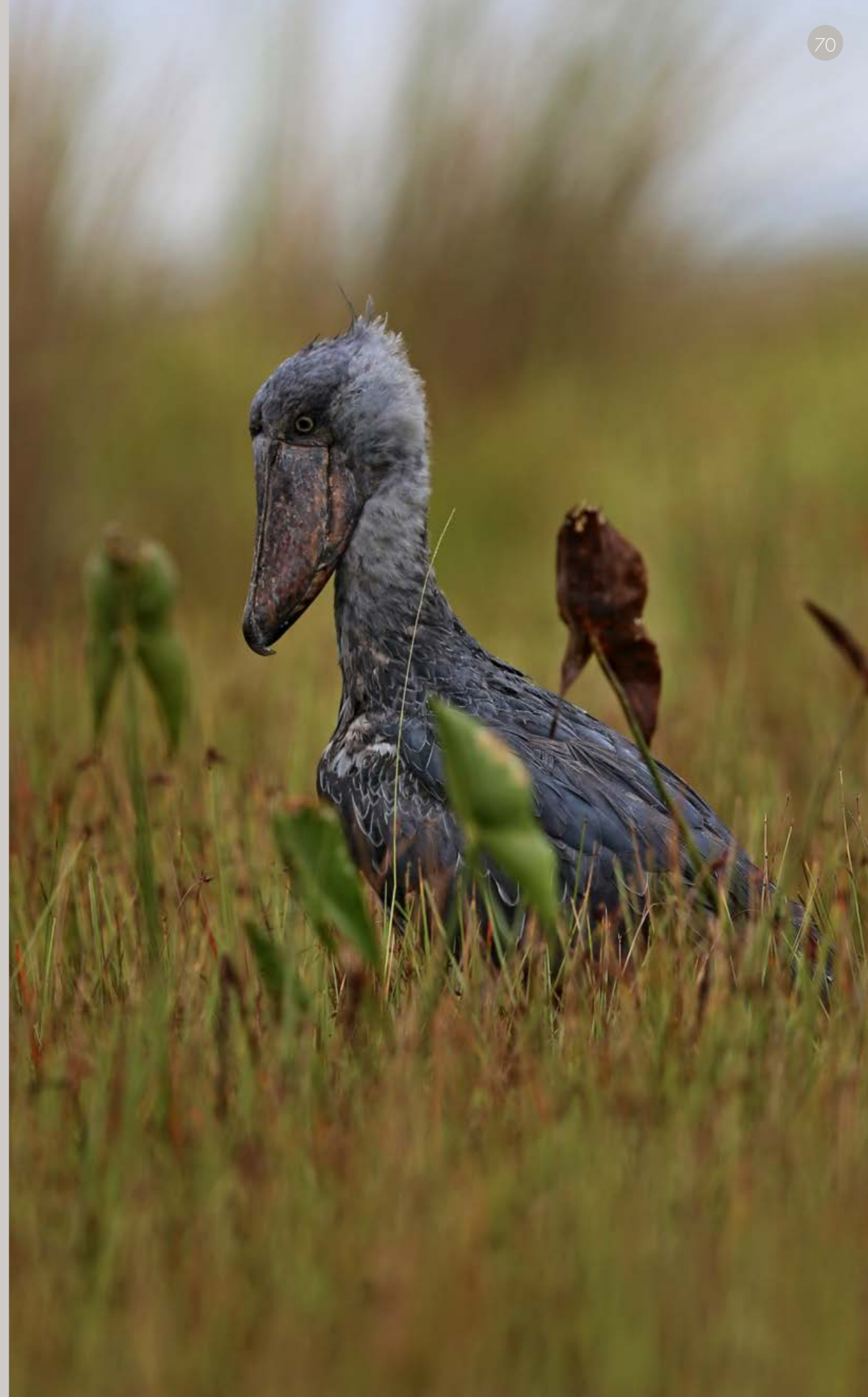
Shoebill Balaeniceps rex Uganda, Mubamba Bay wetland, Canon 5D III, 400mm f2,8, ISO 100, 1/500, f3,5