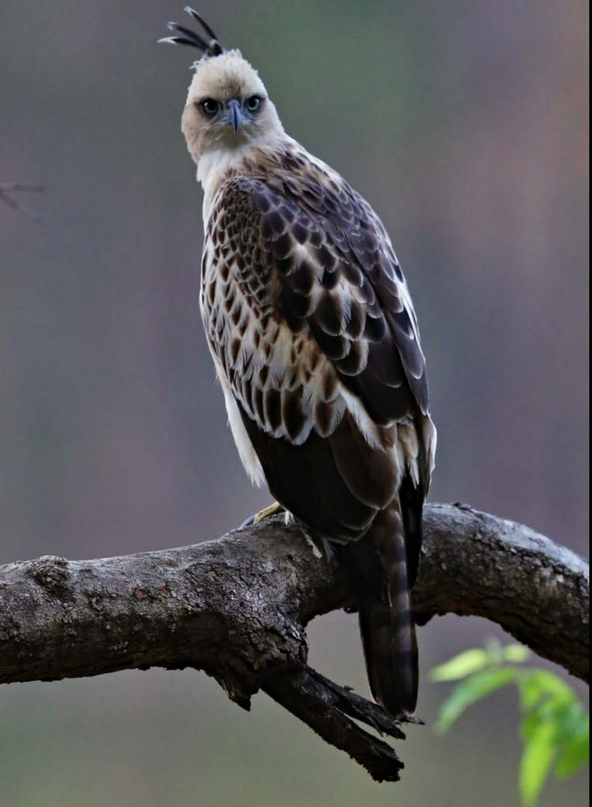
Crested Hawk Eagle Nisaetus cirrhatus India, Kanha National Park, Canon 5D III, 400mm f2,8, ISO 1000, 1/30, f5