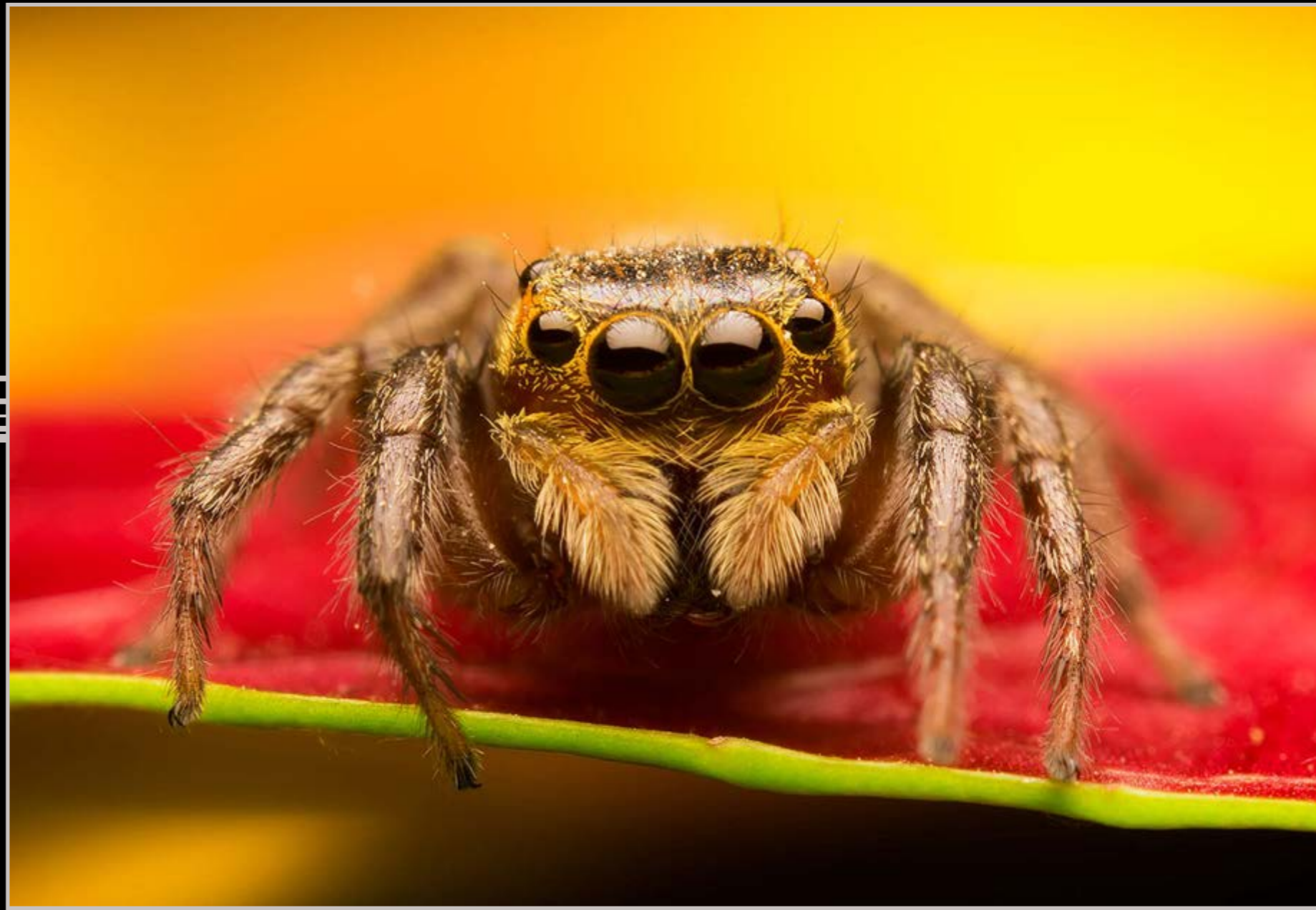
Jumping Spider - Salticidae

Canon EOS 600D, 1/200, f/11, Flash, ISO 100, Canon 50mm f1.8