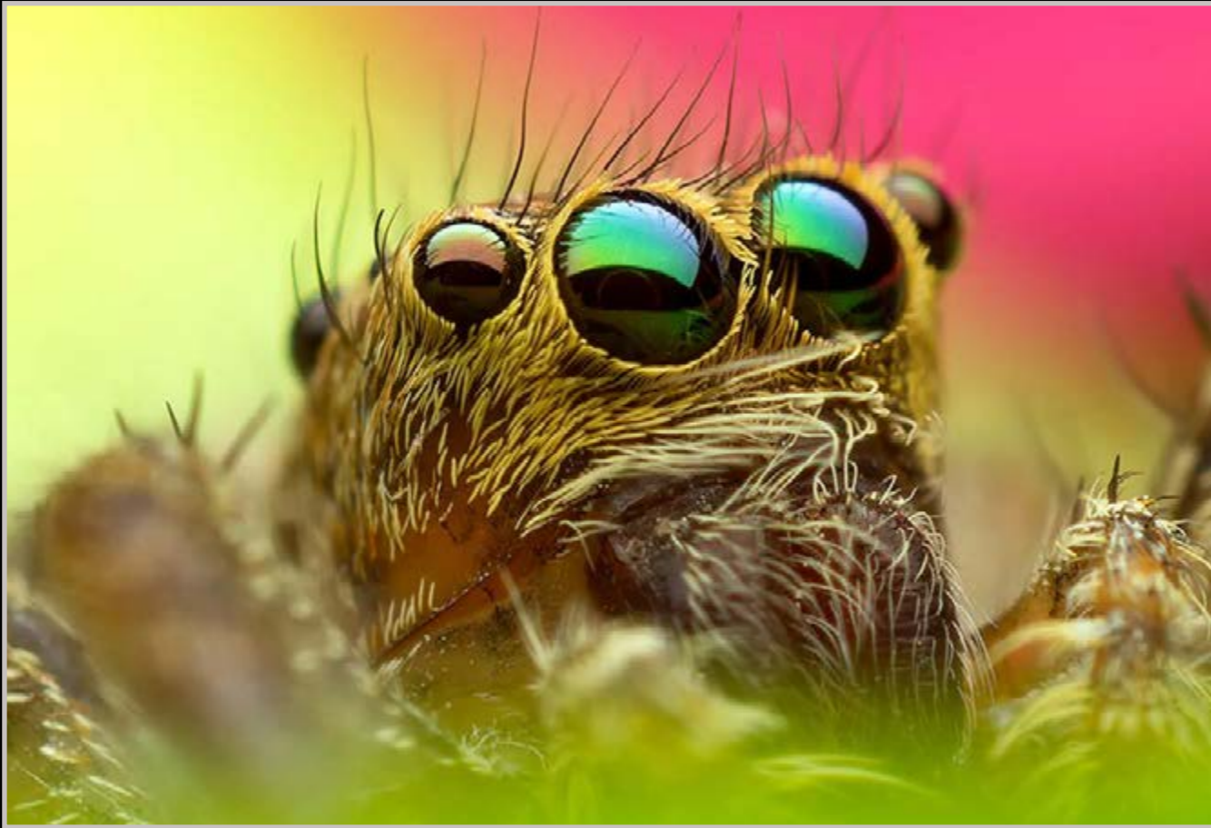
Jumping Spider - Salticidae

Canon EOS 600D, 1/200, f/11, Flash, ISO 100, Canon 50mm f1.8