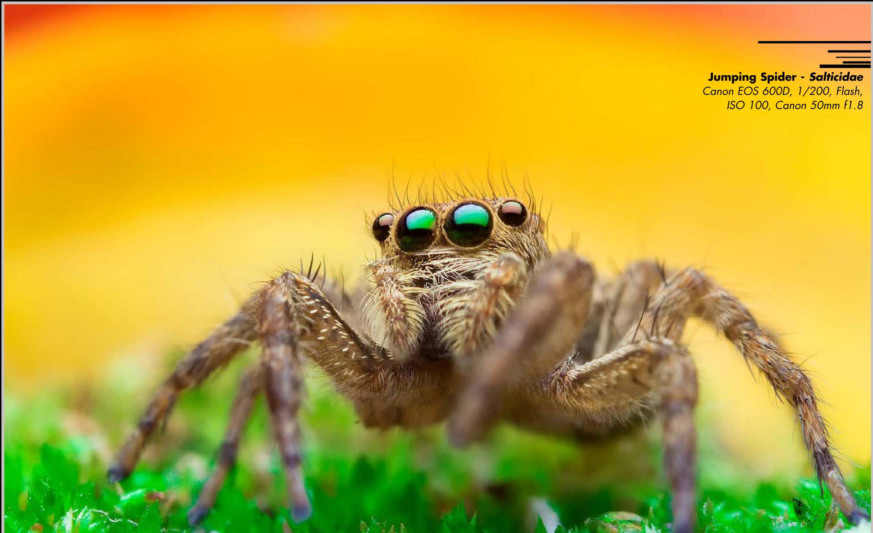
Jumping Spider - Salticidae Canon EOS 600D, 1/200, Flash, ISO 100, Canon 50mm f1.8