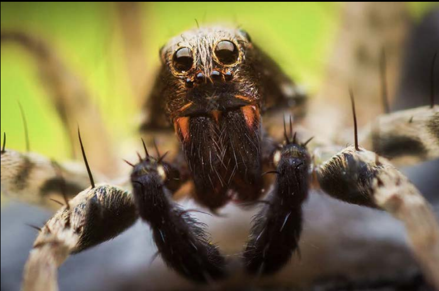
Wolf Spider - Lycosidae

Canon EOS 600D, 1/200, Flash, ISO 100, Canon 50mm f1.8