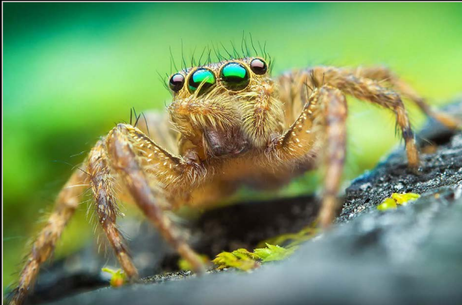
Jumping Spider - Salticidae Canon EOS 600D, 1/200, Flash, ISO 100, Canon 50mm f1.8