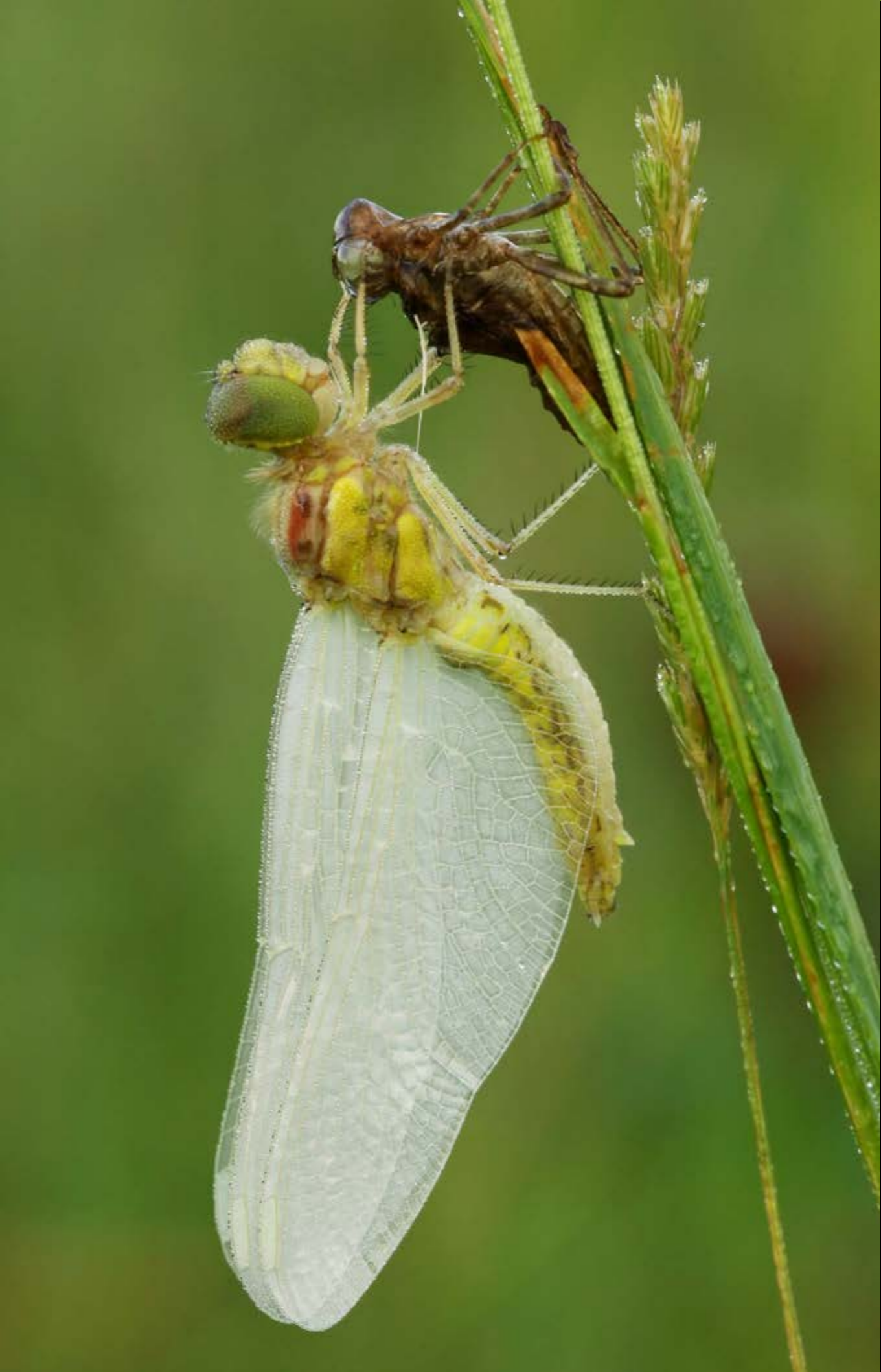
Fresh Darter Canon EOS 400D, 1/15 sec., f/10, ISO-200, Sigma Macro 150mm 2.8, Tripod. Darter (possibly Sympetrum striolatum ?) emerging as an adult. Kehl (BW), Germany.