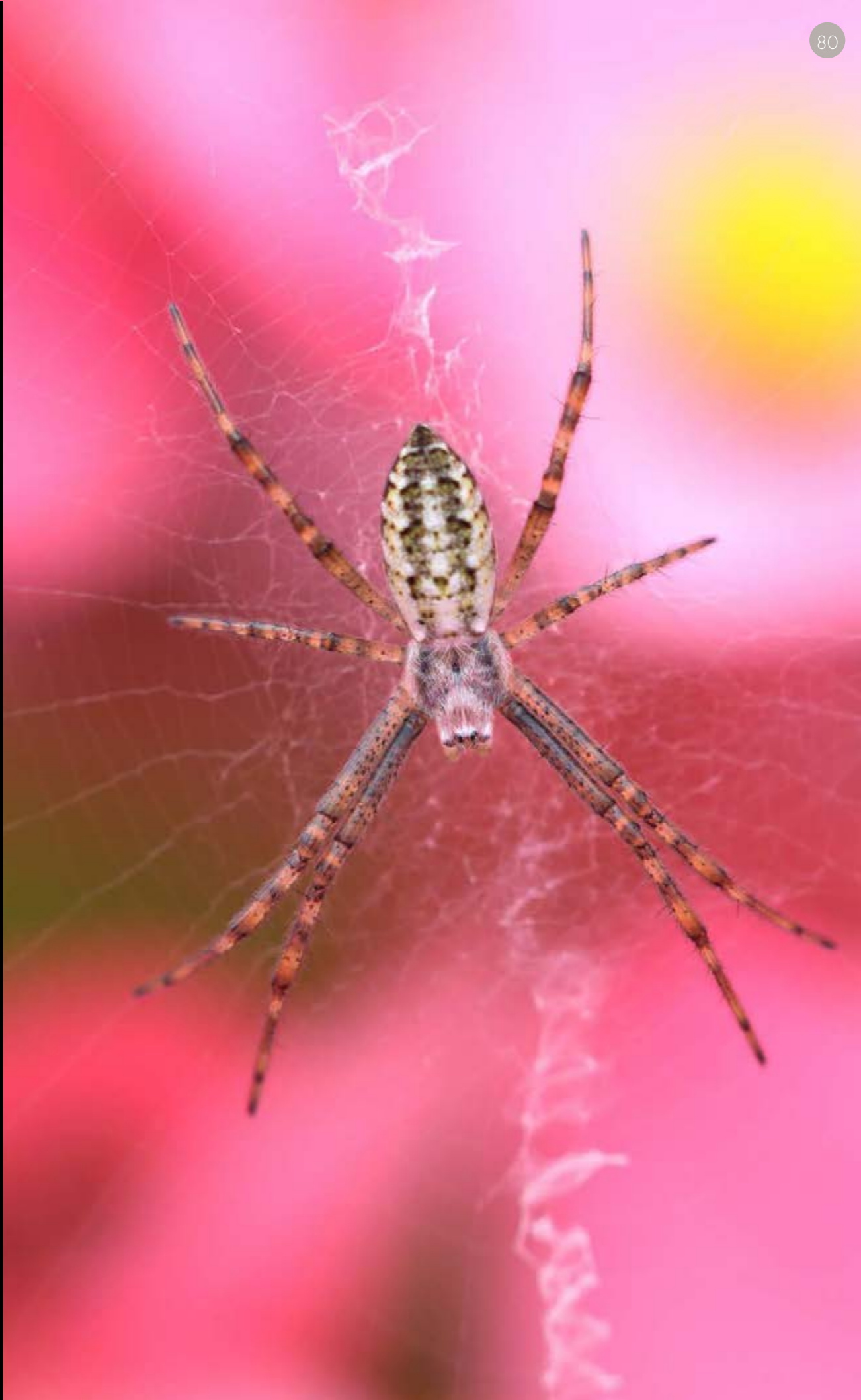
Wasp Spider spiderling Canon EOS 7D, 1/10 sec., f/5.6, ISO-100, Sigma Macro 150mm 2.8, Tripod. A little spiderling of the Wasp Spider Argiope bruennichi waiting for its prey. Typical for this species is the zigzag shape called the stabilimentum at the center of the web. Kehl (BW), Germany.