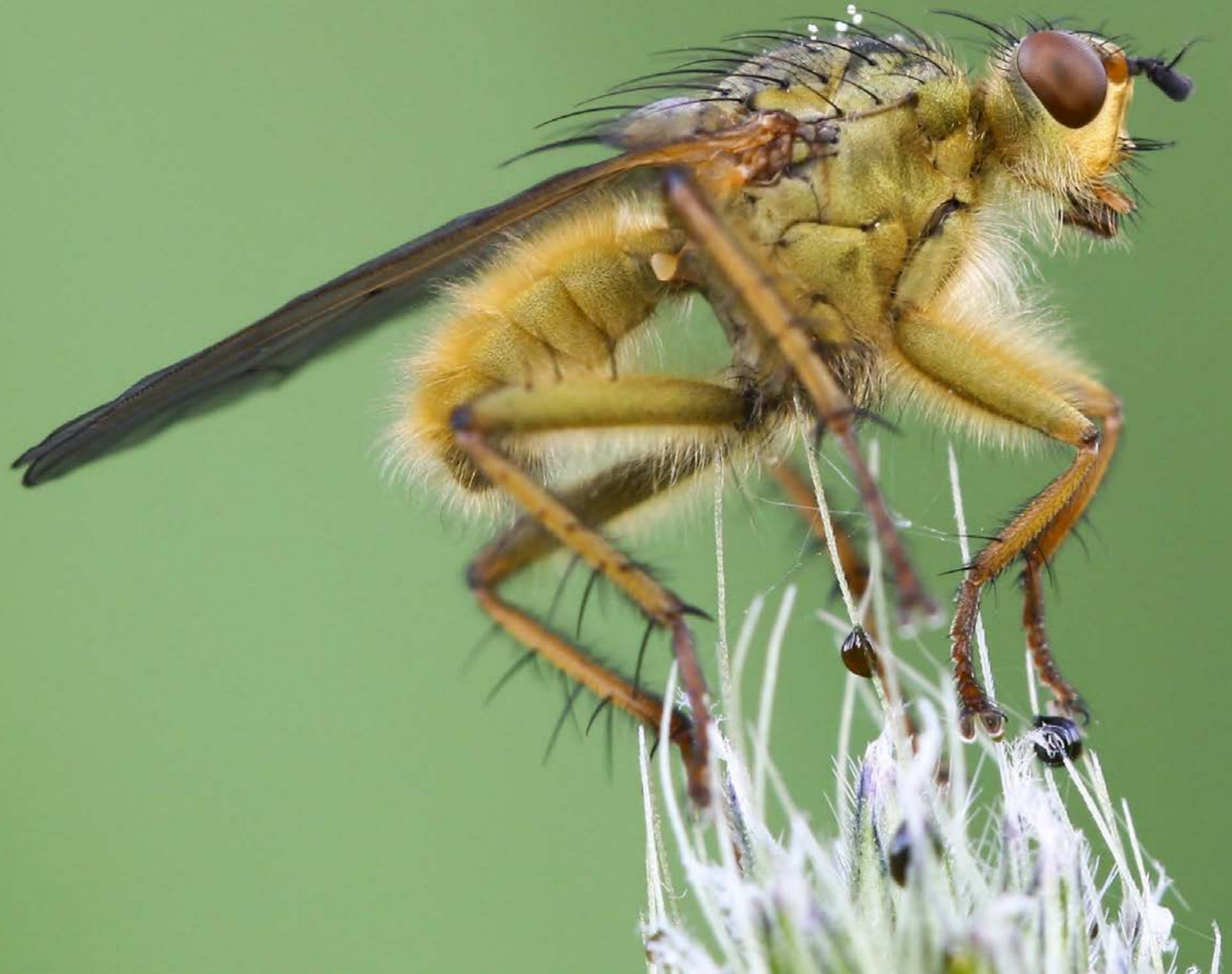
Yellow Dung Fly Canon EOS 400D, 1/3 sec., f/6.3, ISO-200, Sigma Macro 150mm 2.8, Tripod A Yellow Dung Fly Scathophaga stercoraria on a small flower. Kehl (BW), Germany.